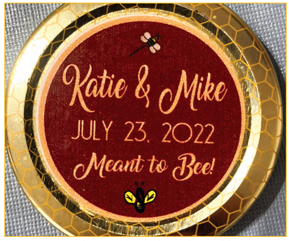
A custom label made for a wedding which featured favours of Smirlholm Farms honey.