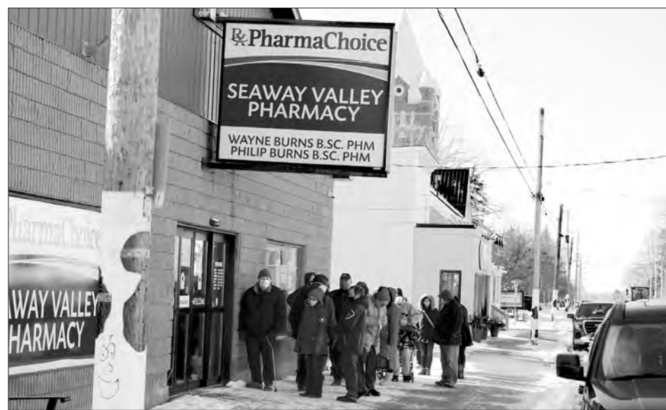
they get to the last person in the lineup. In this photo, a small lineup is all that is left on Tues., Dec. 21 after the pharmacy was only an hour or two into providing booster shots.