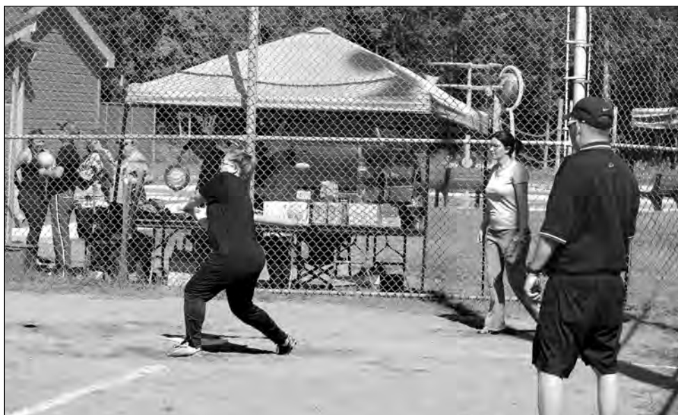
The bat is about to connect with the baseball during one of the early games of the South Stormont Fun Raisers Baseball Tournament in Ingleside.