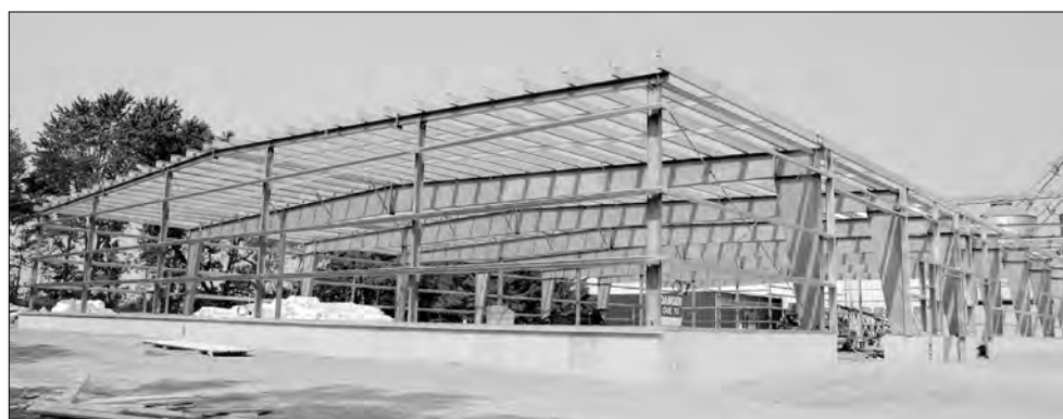
The new processing facility at Sevita will allow for both seed and food grade soybean processing.