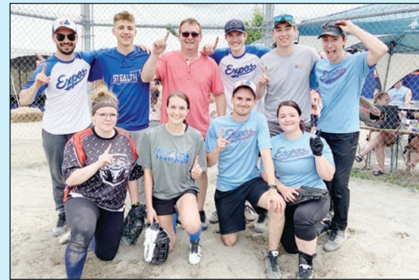
Rec Winners: Les Expos