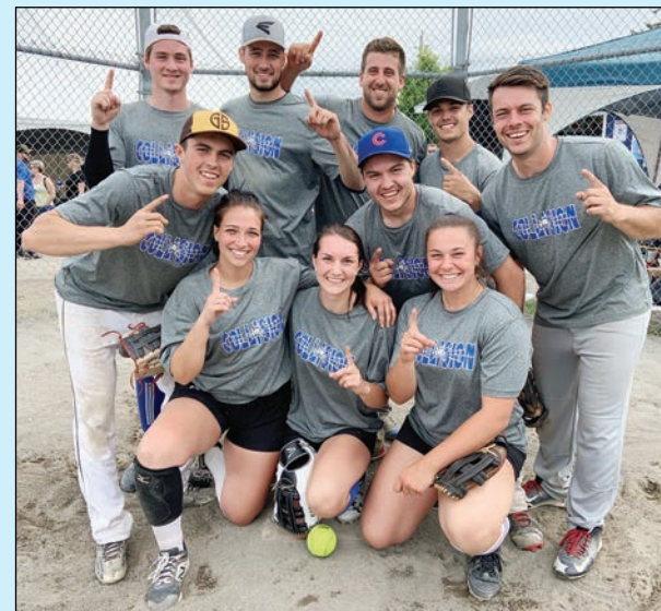
Open Winners: Le Stealth