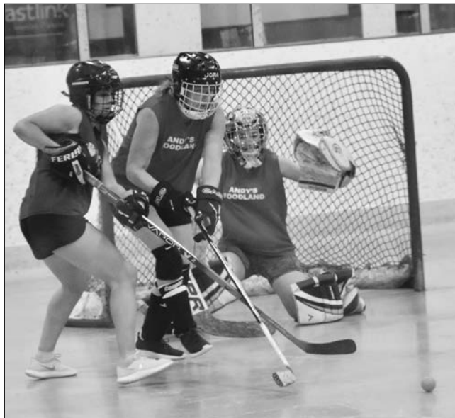
Green took on Red on Thurs., April 25 in the Chesterville Women’s Ball Hockey League. Green’s players battled hard to get the ball past Red but Red’s defense held strong, taking the game 5-2.

The Chesterville Women’s Ball Hockey League will return to the Chesterville arena on Thurs., May 3, when Blue faces Red and Yellow challenges Green.