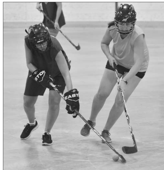
The Blue and Yellow teams played defensive games on Thurs., April 25. Goalies were the stars of the game with Yellow’s only letting one goal slip past giving Blue the 1-0 win in the third period.